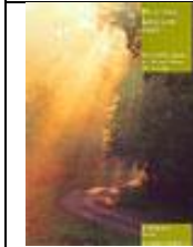
Loss and Grief

9 Lessons. Separate Facilitator and Group Member Guides