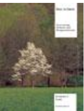
Free to Grow

Free to Grow focuses on ways to let go of the disappointments of the past so that a new future can be opened up. This is a very important area for all of us, but is of special concern among the incarcerated. The 12-session format allows a sufficient time period for participants to get to know you and open up and share in lesson material. It is the longest of our six units